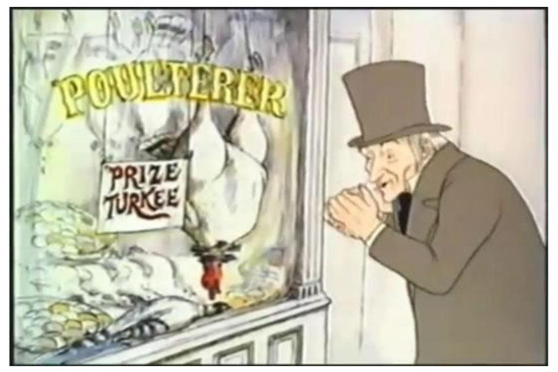
He dressed and went to the butcher. He ordered a huge Christmas dinner to be secretly delivered to Bob Cratchett's home.